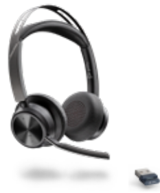
VOYAGER FOCUS 2 UC