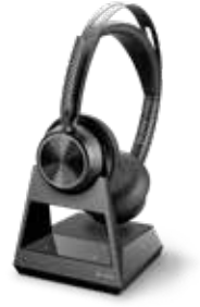
VOYAGER FOCUS 2 OFFICE