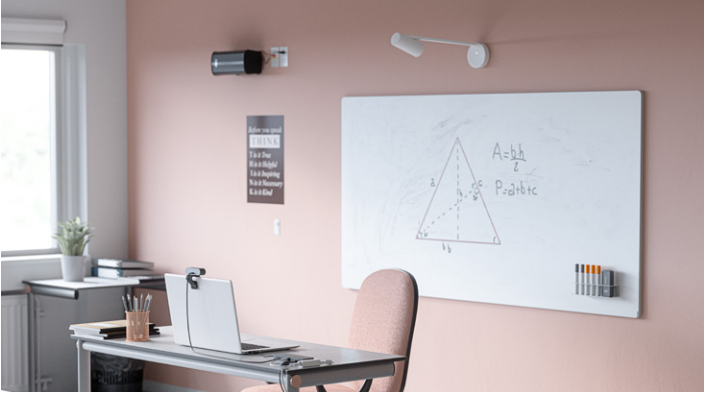
Plug and Play Ready Scribe offers the versatility to connect to your Zoom meetings as a USB camera.