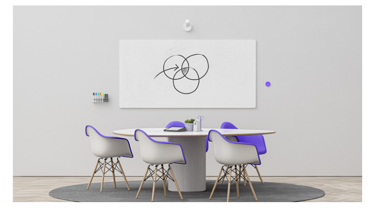
Works with Any Whiteboard Works with all whiteboard surfaces, capturing up to 6' W by 4' H, and any set of dry erase markers.